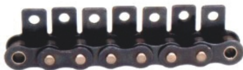
SA-1/M1 (one side)