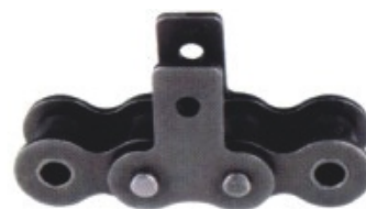
SK-1/M1 (both sides)